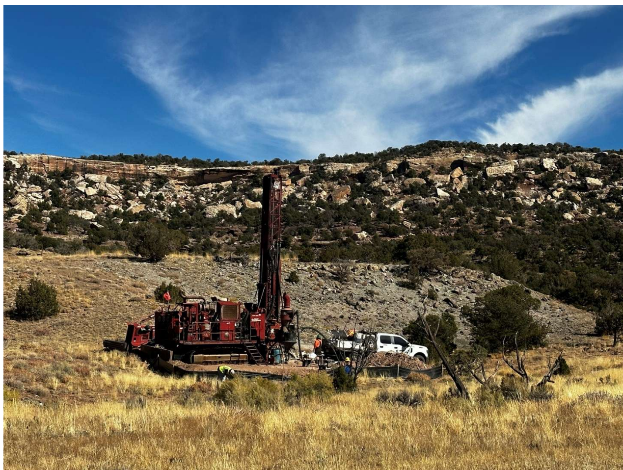
Drilling at Section 23, Wedding Bell Uranium Project, USA

For the six months ended 31 December 2024